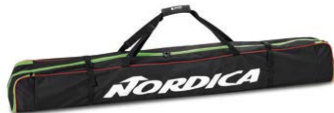
RACE SINGLE SKI BAG ON301700 A43 BLACK/GREEN/WHITE sizes 175(+30)x23x19 cm capacity 75(+10) lt