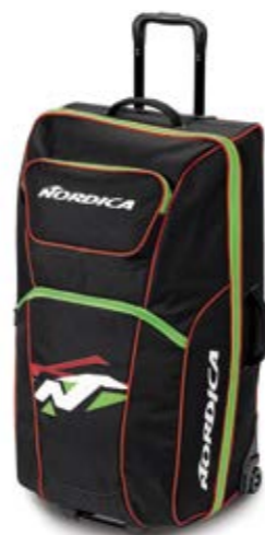
RACE XL TROLLEY ON301900 A43 BLACK/GREEN/WHITE sizes 41x76x37 cm capacity 110 lt