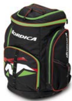
RACE XL GEAR PACK ON301200 A43 BLACK/GREEN/WHITE sizes 64x58x47 cm capacity 85 lt