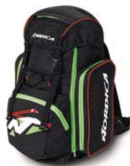
RACE BACKPACK ON301100 A43 BLACK/GREEN/WHITE sizes 40x60x26(+10)cm capacity 40(+15) lt