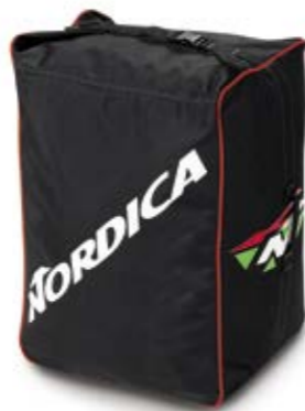
RACE DUFFLE PACK ON301600 A43 BLACK/GREEN/WHITE sizes 48x38x68 cm capacity 120 lt