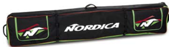
RACE DOUBLE ROLLER SKI BAG ON301800 A43 BLACK/GREEN/WHITE sizes 36x200x18 cm capacity 120 lt