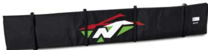
RACE 3 PAIR SKI BAG ON302800 A43 BLACK/GREEN/WHITE sizes 36x200x18 cm capacity 120 lt