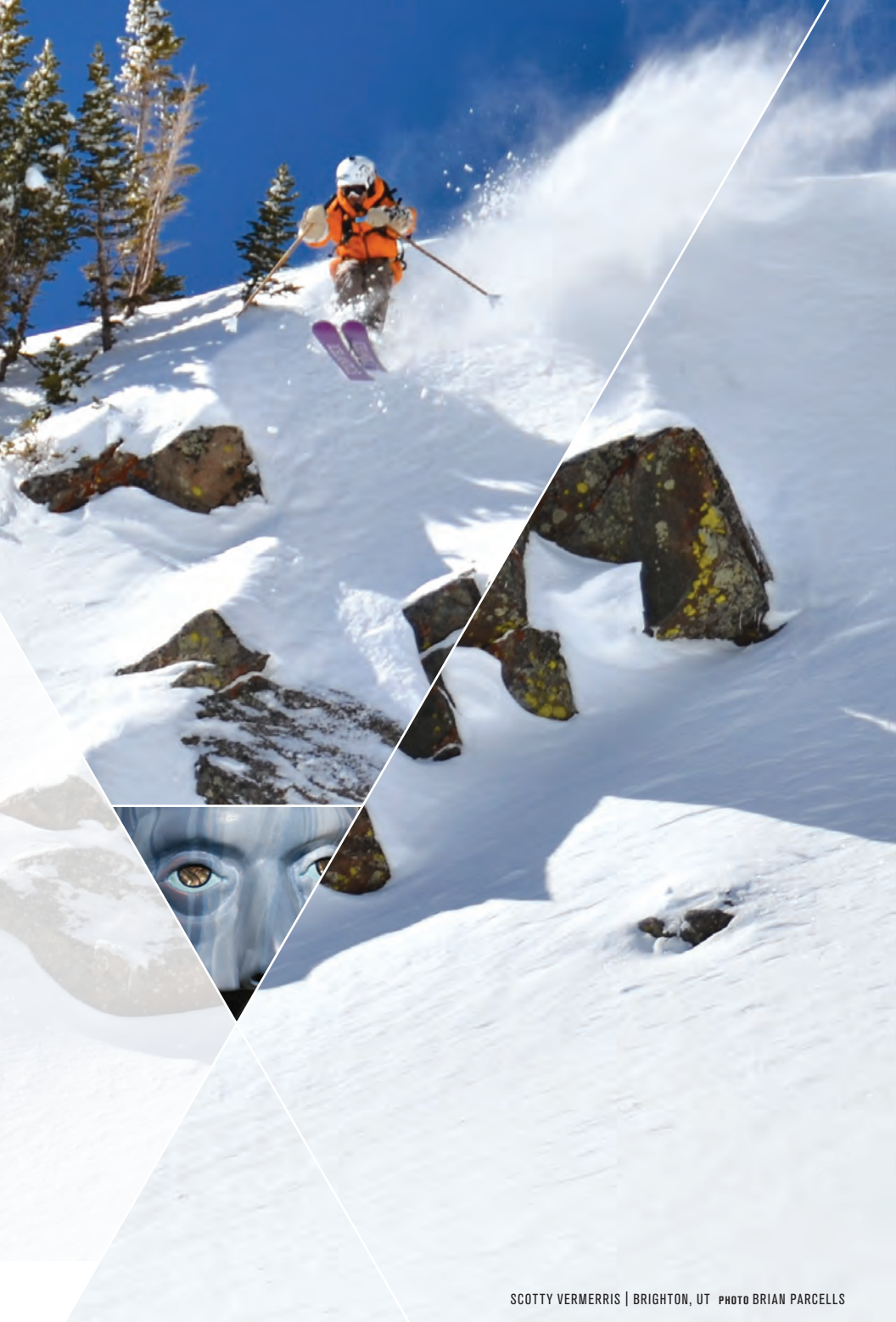
SCOTTY VERMERRIS | BRIGHTON, UT