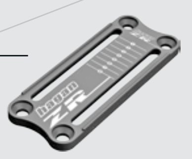
ZR Adjustement Plate