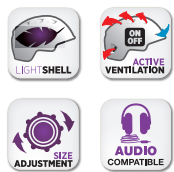
RH1 - PURE WHITE