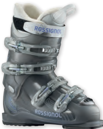
AXIA X 40