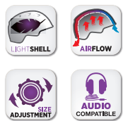
RH1 - FLOWER BLUE