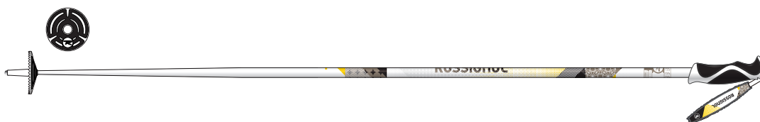
RDE5010 UNIQUE PRO

DIAMETER 14 mm GRIP WOMEN BI-MATERIAL STRAP MOUMOUTE