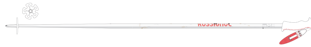
RDD5070 FREERIDE PRO

DIAMETER ..... 16 mm GRIP ..... LEATHER WOMEN WITH LACING STRAP ..... FREERIDE STRAP