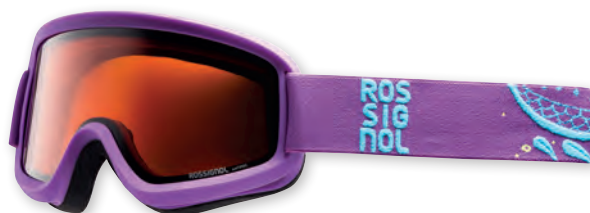
ACE W FLOWER BLUE

LENS DOUBLE, CYLINDRICAL PROTECTION S1 FOAM SINGLE + VELVET RKEG404 PINK