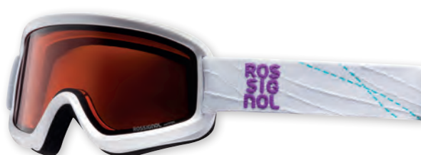
ACE W GLORY

LENS DOUBLE, CYLINDRICAL PROTECTION S2 FOAM SINGLE + VELVET RKEG406 WHITE