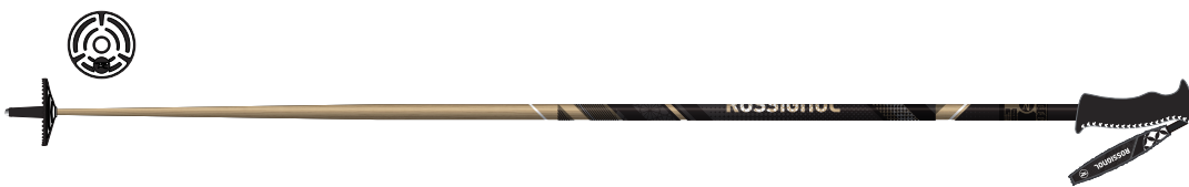
RDE5000 UNIQUE CARBON

DIAMETER 14 mm GRIP LEATHER WOMEN STRAP MOUMOUTE