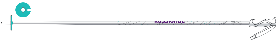
RDE5070 GLORY POLE

DIAMETER ..... 16 mm GRIP ..... WOMEN MONO BI-MAT STRAP ..... NYLON & OVER-MOLDED BUCKLE