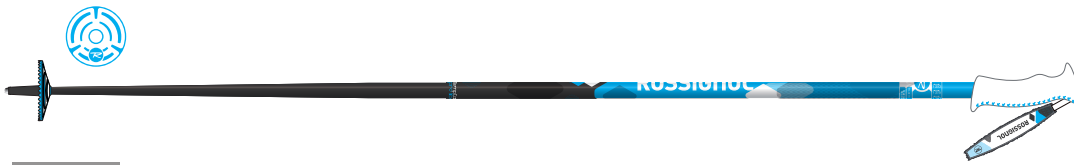
RDE5040 TEMPTATION PRO FIBER

DIAMETER ..... 16 mm GRIP ..... LEATHER WOMEN STRAP ..... MOUMOUTE