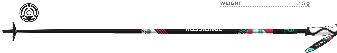
RDE5020 UNIQUE ALU

DIAMETER 16 mm GRIP WOMEN BI-MATERIAL STRAP MOUMOUTE