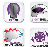
RH2 - FLOWER BLACK