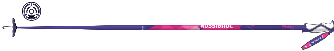
RDE5050 TEMPTATION PRO

DIAMETER ..... 14 mm GRIP ..... WOMEN BI-MATERIAL STRAP ..... MOUMOUTE