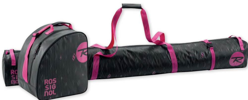
W BOOT BAG