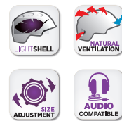
RH2 - LADIES MIPS