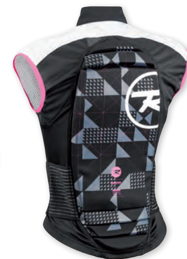
ROSSIFOAM VEST BACK PROTEC ATTRAXION

FEATURES Padded handle, 2 compression straps MATERIAL POLYESTER 600D FABRIC COATING PVC DIMENSIONS L1630xW210xH210 mm WEIGHT 1,09 kg