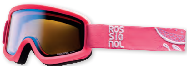
ACE W FLOWER PINK