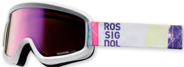
ACE W GIRLY

LENS DOUBLE, CYLINDRICAL PROTECTION S2 FOAM SINGLE + VELVET RKEG405 BLUE