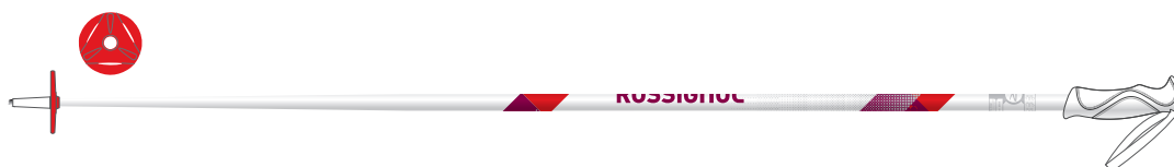
RDE5030 UNIQUE ALU LIGHT

DIAMETER 16 mm GRIP WOMEN MONO BI-MAT STRAP NYLON & SECURITY