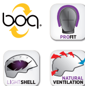
RH2 - FREE