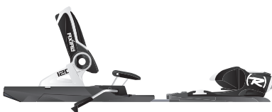
RCDR080 AXIAL 3 120 SPEEDSET B120 BLACK WHITE